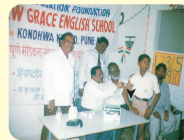
Free Hepatitis B Vaccination Program in association with the