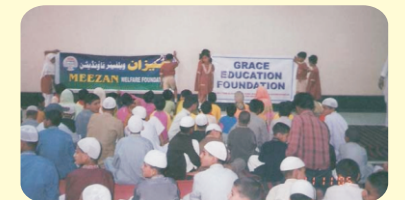
Eid-Milan Program for Kashmiri children organised in association with Meezan Welfare