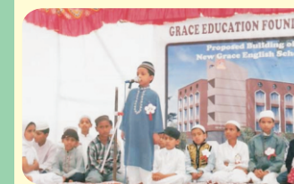
The Foundation organised Hamd & Naat Competition on 23rd Dec. 06 for Madrasas & Anjuman. Cash prizes was awarded