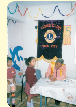
A Free general health check-up camp was organized in co-ordination with Dr.