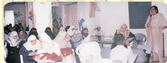
The best possible outcome from a student can only be achieved through a synergy of teaching skills and a nurturing attitude. Thus, teachers training programmes and similar workshops are organised on a regular basis.