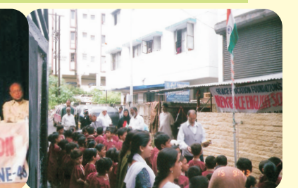
Distribution of Gifts & Sweets on the occasion of Flag hoisting.